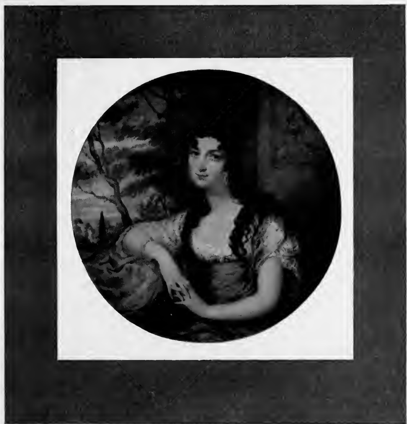
THE COUNTESS OF JERSEY BY SIR GEORGE HAYTER (1819)

1 2 3 4 5 6 7 8 9 10 11 12 13 14 15 16 17 18 19 20 21 22 23 24 25 26 27 28 29 30 31 32 33 34 35 36 37 38 39 40 41 42 43 44 45 46 47 48 49 50 51 52 53 54 55 56 57 58 59 60